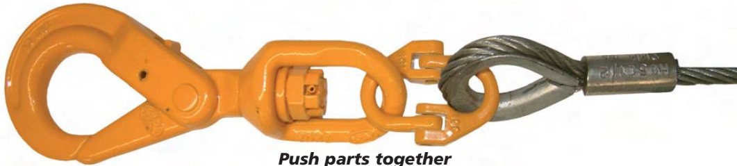
Push parts together