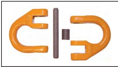
Complete Kit HK0410

Comprises two connector parts, central pin and spring steel circlip