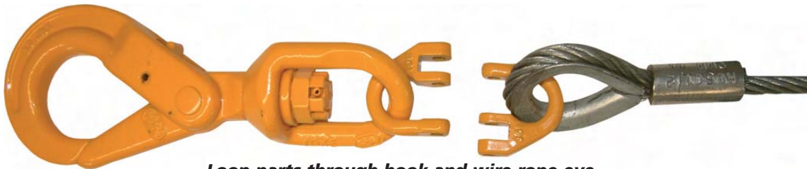
Loop parts through hook and wire rope eye